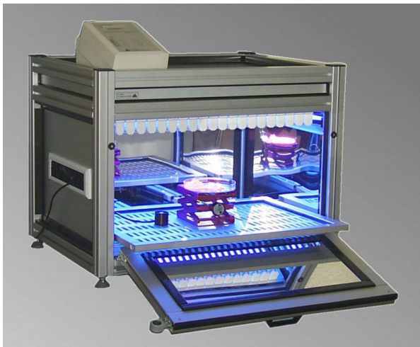
Abb. 1: UV/VIS irradiation chamber BS-03 with dose controller UV-MAT

The irradiation chamber BS-03 is a midsize, robust equipment for the time- or dose-controlled uniform irradiation of samples with UV or visible light. The chamber can be fully equipped for one of the spectral regions UV-C, UV-B, UV-A or daylight D65 in order to get the highest irradiance. Alternately, the use of two separately controlled lamp groups for different spectral regions allows an especially flexible operation of the chamber.