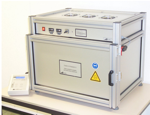
Abb. 1: UV/VIS irradiation chamber BS-03 with dose controller UV-MAT

The irradiation chamber BS-03 is a midsize, robust equipment for the time- or dose-controlled uniform irradiation of samples with UV or visible light. The chamber can be fully equipped for one of the spectral regions UV-C, UV-B, UV-A or daylight D65 in order to get the highest irradiance. Alternately, the use of two separately controlled lamp groups for different spectral regions allows an especially flexible operation of the chamber.